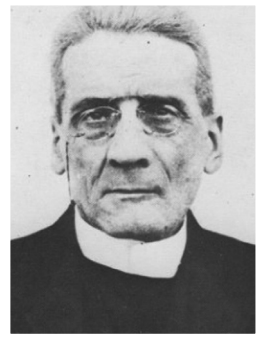
History of Geo- and Space Sciences